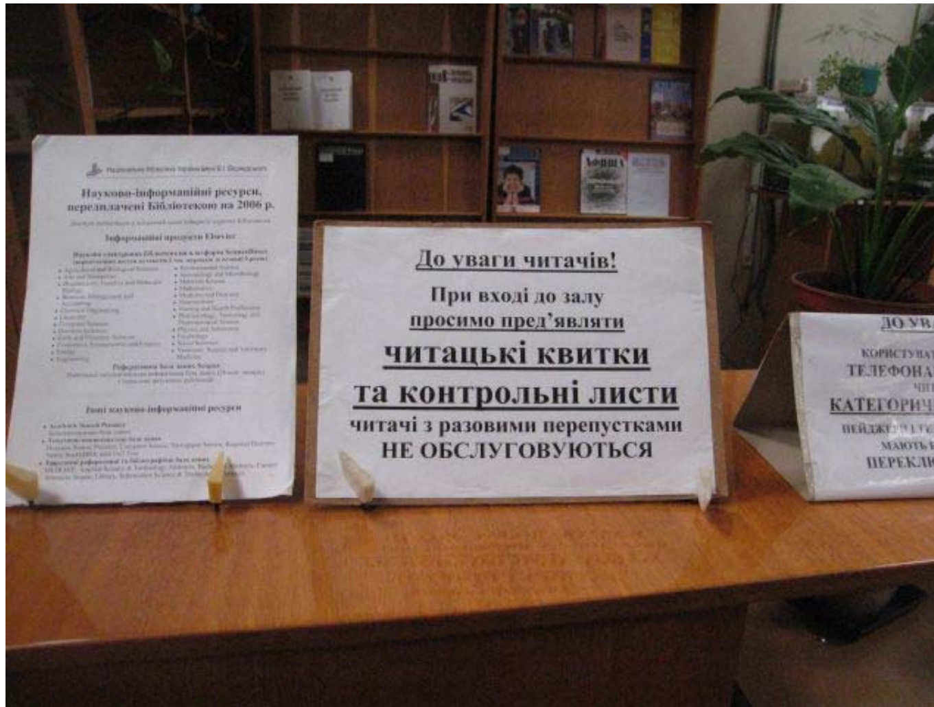
“Current Periodicals Desk: Only people with permanent library cards will be served” (ie doctorate holders only – no day passes)